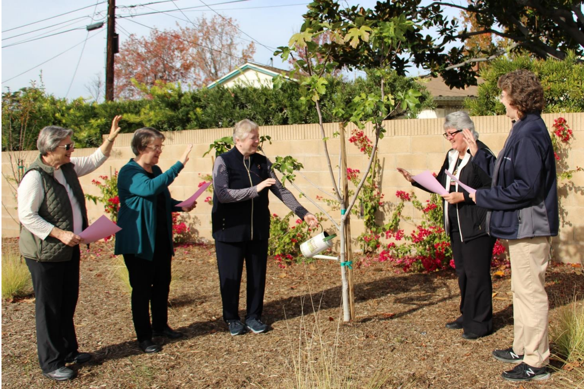
The Sisters of St. Joseph of Orange's leadership team planting a tree in honor of Fr. Medaille.

U.S. Federation Note: To celebrate the 350th anniversary of the death of Fr. Medaille, Sisters of St. Joseph from around the world are planting trees in his honor.