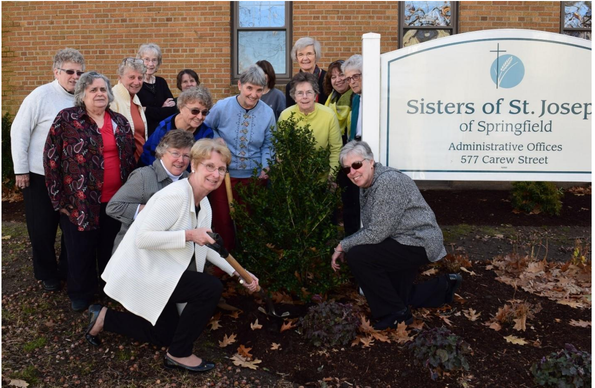
The Sisters of St. Joseph of Springfield planted a tree for Fr. Medaille in November 2019.

Lord, let us plant a tree of hope in our hearts today. Help us to make our lives a garden. Let us fill our world with promises of love and peace. Let us plant the flowers of goodness, gentleness and kindness. Let us sow the seeds of joy. Help us, Lord, to plant a tree of hope in the heart of everyone we meet today. And may this tree speak of our care for all of creation to all who pass by."