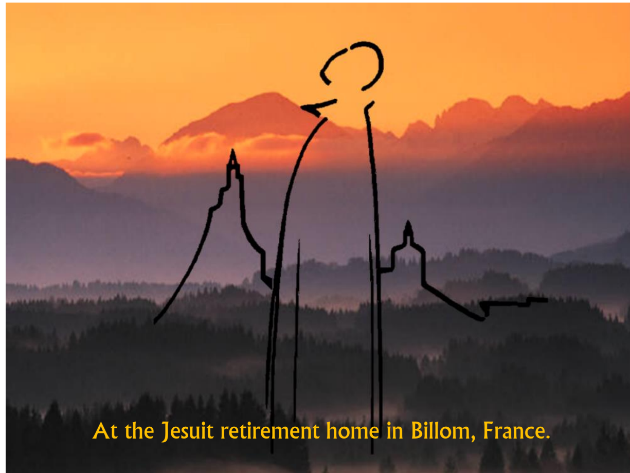
At the Jesuit retirement home in Billom, France.