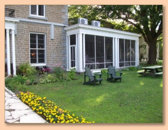
ENJOY MEALS IN SCREENED PORCH

Galilee Centre 398 John Street, N., Arnprior, Ontario. Canada. K7S 2P6