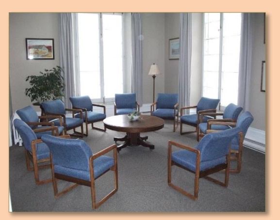
COMMUNAL CONTEMPLATIVE PRAYER