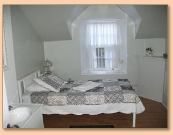
PRIVATE ROOMS WITH SINK