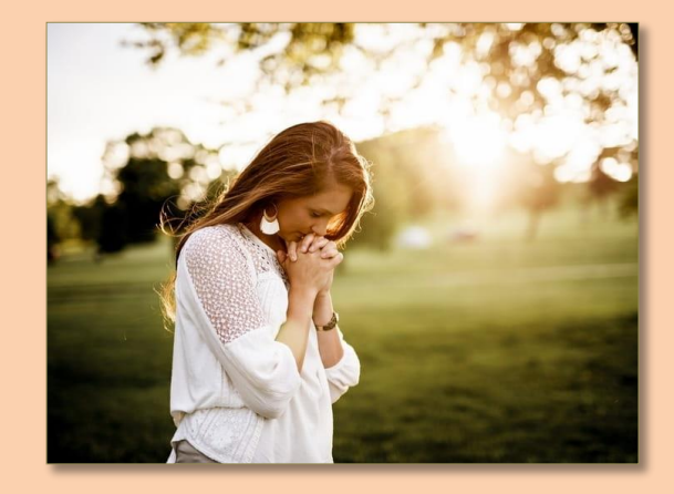
PAUSE AWHILE AND KNOW THAT I AM GOD. Psalm 46:10

REGISTRATION FORM ... please cut off and return with your cheque deposit to Galilee Centre or register at <u>Galilee Centre website</u>: